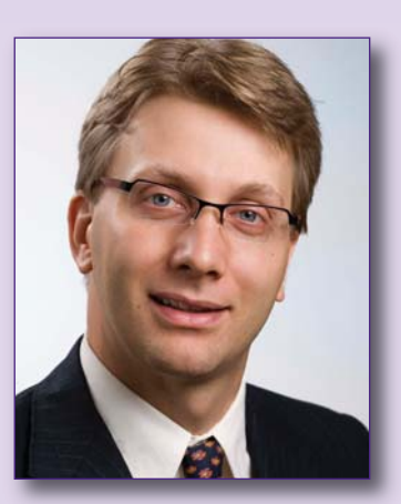
I wanted to practice in the broad and diverse community that has been my home for most of my life."